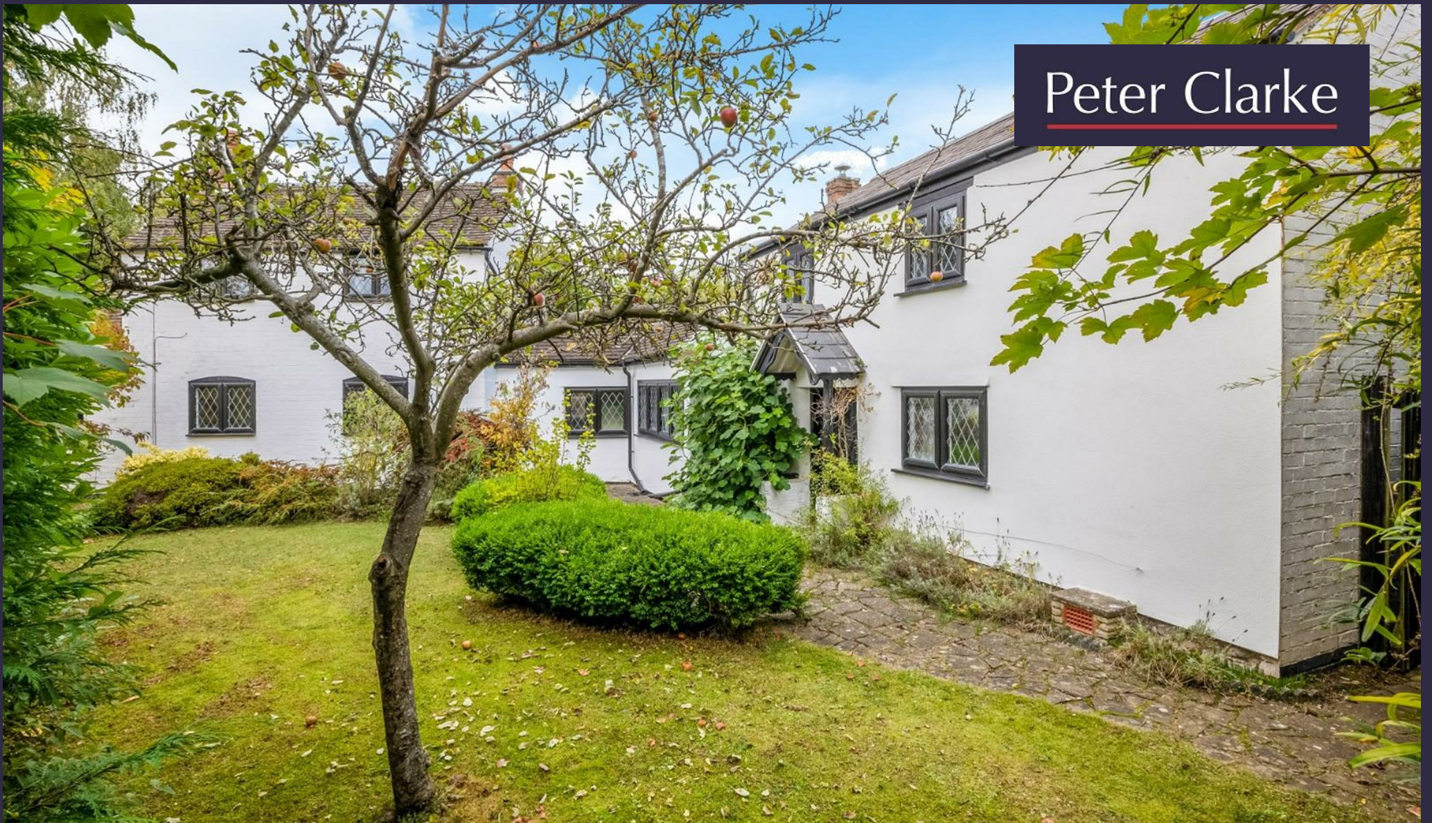
Forge Cottage Hockley Lane, Ettington, Stratford-upon-Avon, CV37 7SS